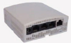
AP 7502E Wallplate 802.11ac Up to 867 Mbps 2X2 MIMO