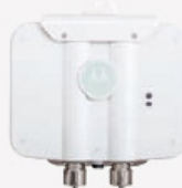
AP 6562E Outdoor 802.11n Up to 600 Mbps 2x2 MIMO