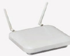
AP 7522E Indoor 802.11ac Up to 867 Mbps 2X2 MIMO